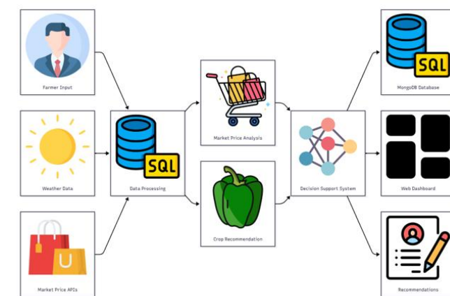
Figure 1 : System Architecture of Smart Agriculture Market Intelligence And Decision Support System for Farmers.

The proposed system collects agricultural market information from multiple data sources, including agricultural market databases, government agricultural portals, and weather information services. The collected data includes crop price information, market demand trends, seasonal agricultural patterns, and environmental conditions. The system processes this information using analytical techniques to identify price trends and market opportunities for farmers. Based on this analysis, the system provides